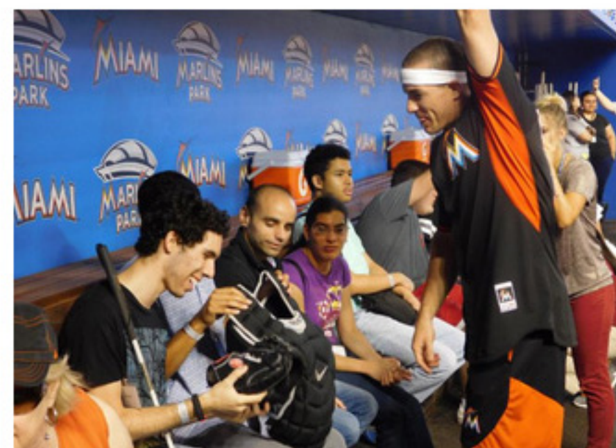
Our Transitions students with Miami Marlins Catcher J.T. Realmuto

Our Transition students were in for quite the treat this month! Having experienced a "touch tour" at Marlins Stadium and having spent time with Marlins catcher J.T. Realmuto in the dugout before our hometeam took on the Atlanta Braves, the students had a fantastic time! Thank you to the Miami Marlins Foundation for partnering on such a wonderful and memorable experience!