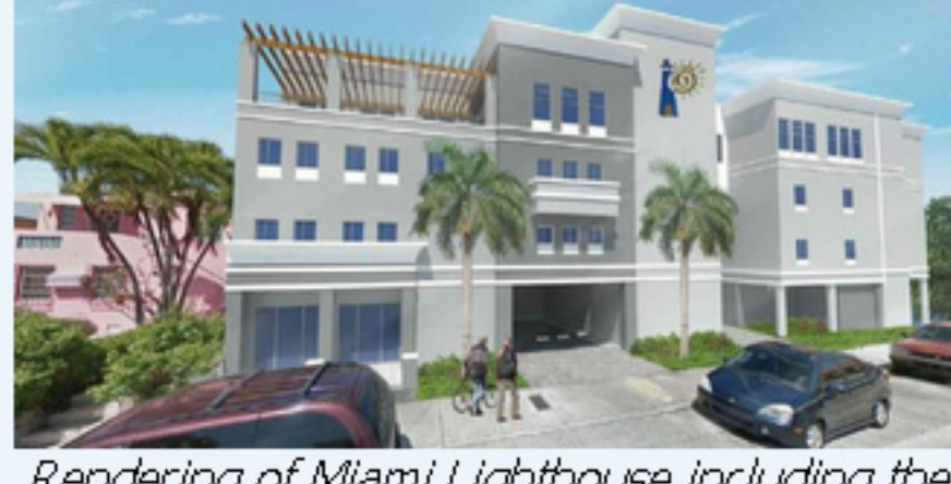
Rendering of Miami Lighthouse including the Lighthouse Learning Center for Children™

The groundbreaking ceremony will be held in collaboration with Murilla Construction Management and Wolfberg Alvarez & Partners.